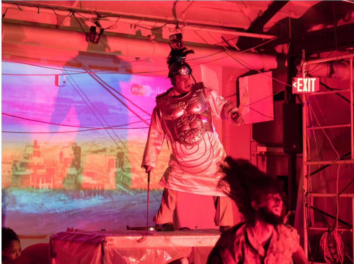
~ Under Construction , photo credit: Jim Carmody