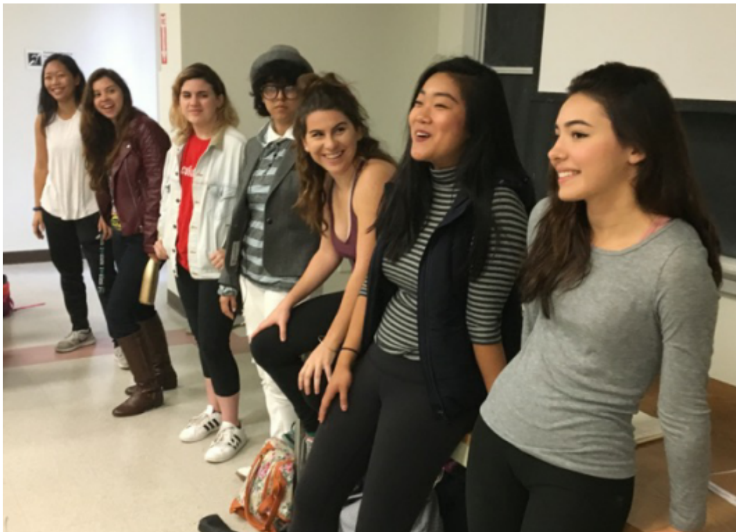
~The cast of She Kills Monsters speaks to Intro to Theatre Class