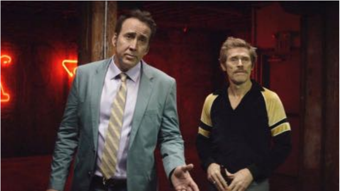
(Video still from Matthew Wilder's "Dog Eat Dog")