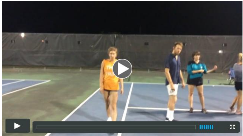
THE TRIP's THREE SISTERS