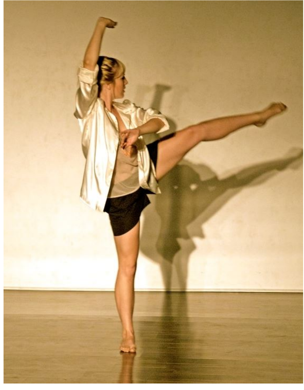
"Left Eye, Right I"

Performances: Thursday, June 4th at 8pm Friday, June 5th at 8pm Saturday at 4pm and 8pm Sunday at 2pm and 5pm Thursday, June 11th at 8pm Friday,June 12 at 8pm Saturday,June 13th at 4pm and 8pm Sunday, June 14th at 2pm and 5pm