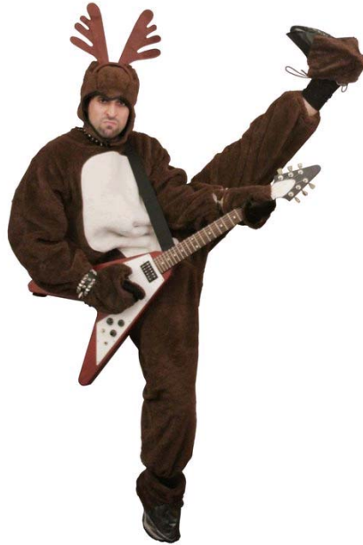
Ryan the Reindeer