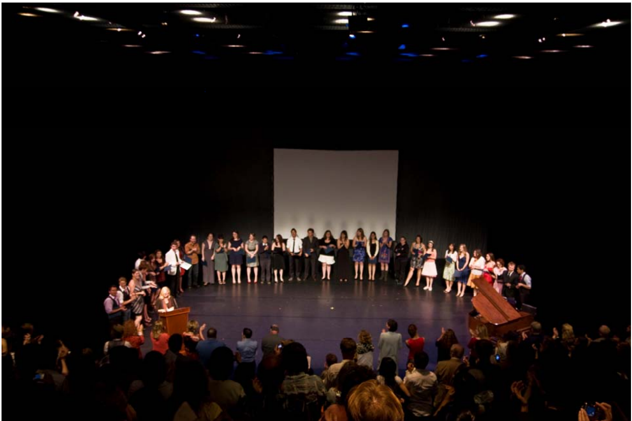
The Undergraduate Class of '09 at the Awards Ceremony, Friday, June 5 th , 2009.